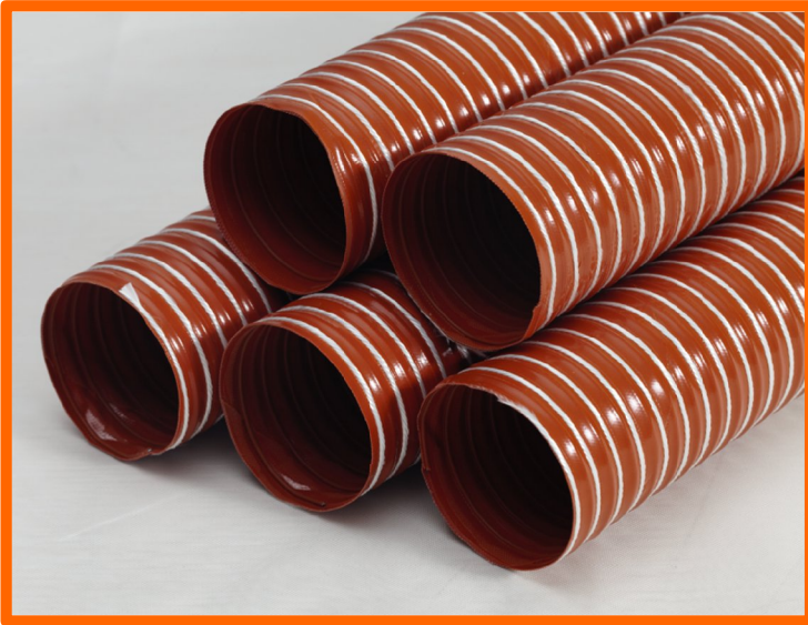
1 Layer Silicone

5/8" / 16mm to 10" / 254mm ID – 13 foot / 4 m lengths