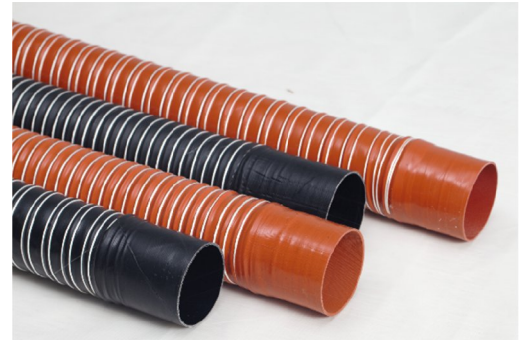
Duct with cuffs installed