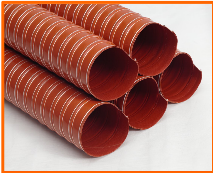
2 Layer Silicone