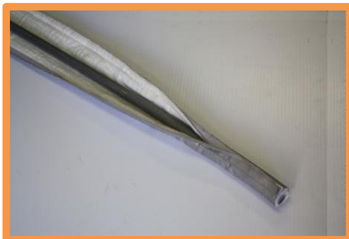
Photo above shows the wrap with the liner installed