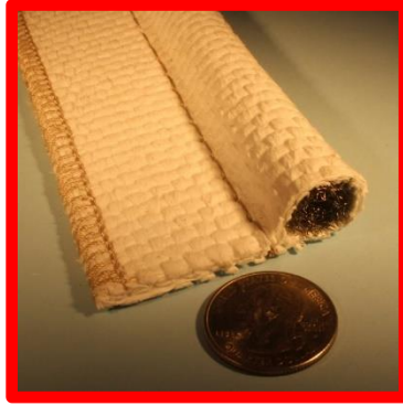
Metal Mesh Rope Core